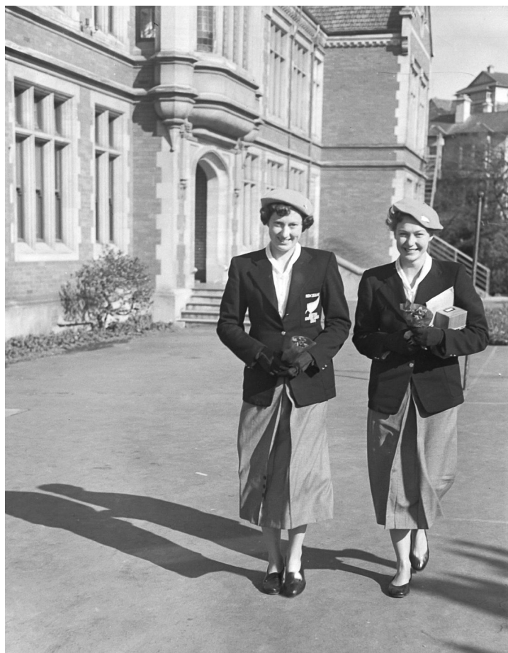
Jean Stewart at right with Yvette Williams visiting Otago Girls' in 1954.

We were saddened to hear of the recent passing of ex-girl and Olympian Jean Hurring (nee Stewart) who passed away peacefully on Saturday 8 August 2020, in Auckland, aged 89. Jean Stewart attended Otago Girls' from 1945 to 1949. She won a Bronze medal in the 100m backstroke at the 1952 Helsinki Olympics. This was New Zealand's first Olympic swimming medal and remains the only swimming medal won by a New Zealand woman. At the 1952 Olympics Jean was rooming with one of our other outstanding Olympians Yvette Williams.