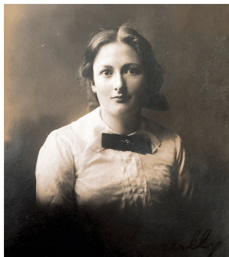
Ella Young, 1913