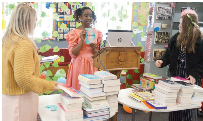
Library Day being Zoomed throughout the school during Level 2 lock-down.